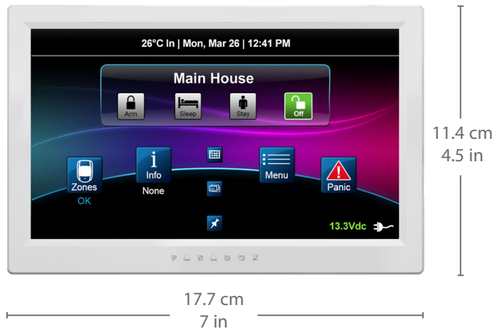
TM70: Intuitive Touchscreen