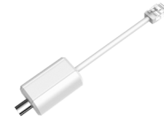
LR1002 ePoE Over Coax Converter