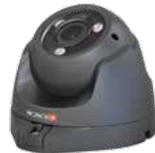
Available in Grey Color