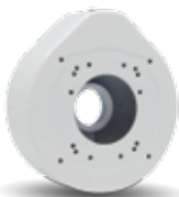
Junction Box (PR-B47JB) is available

Sensor: 1/3", 2 Mega-Pixel Selectable Output: 1080P AHD / CVI / TVI / Analog Lens: 2.8-12mm Mega-Pixel Vari-Focal True Day & Night – ICR IR Range: 35m (42 IR LED) IP66 CoC Support Weight: 836g Power: DC 12V, ~380mA