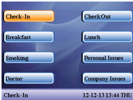
Function keys definition