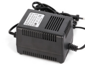
AC24V/3A Power Adapter