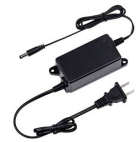
DC12V/2A Power Adapter