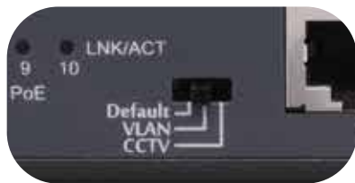
CCTV Mode Switch