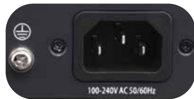
100-240V AC Power Input