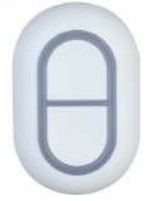
Wireless Panic Button